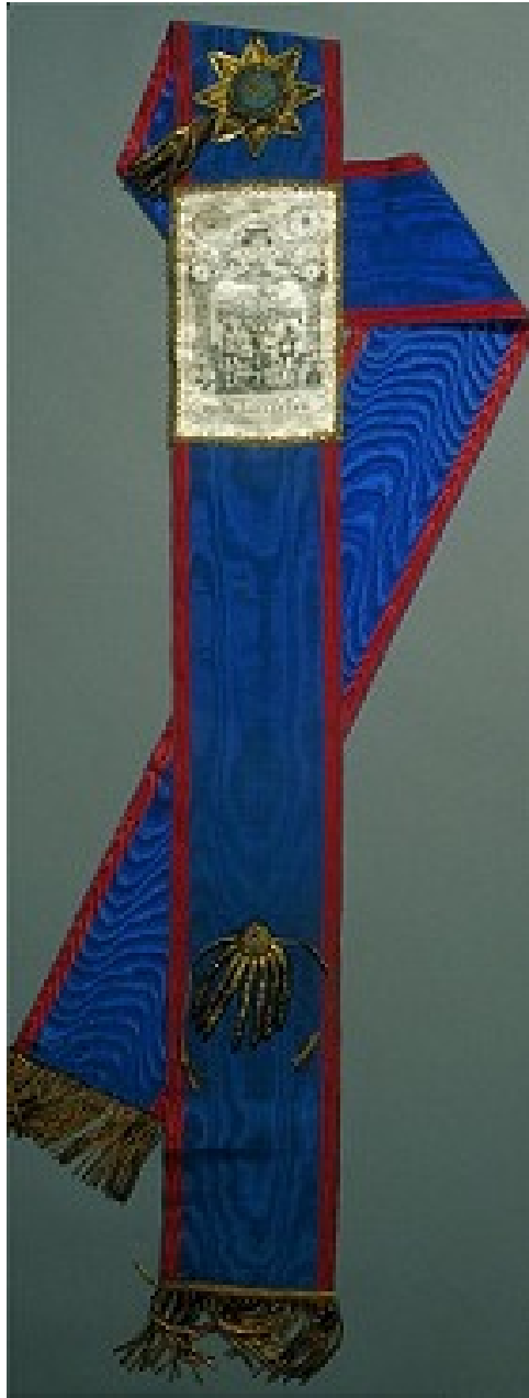
Figure 12 Showing a Sash of the Order