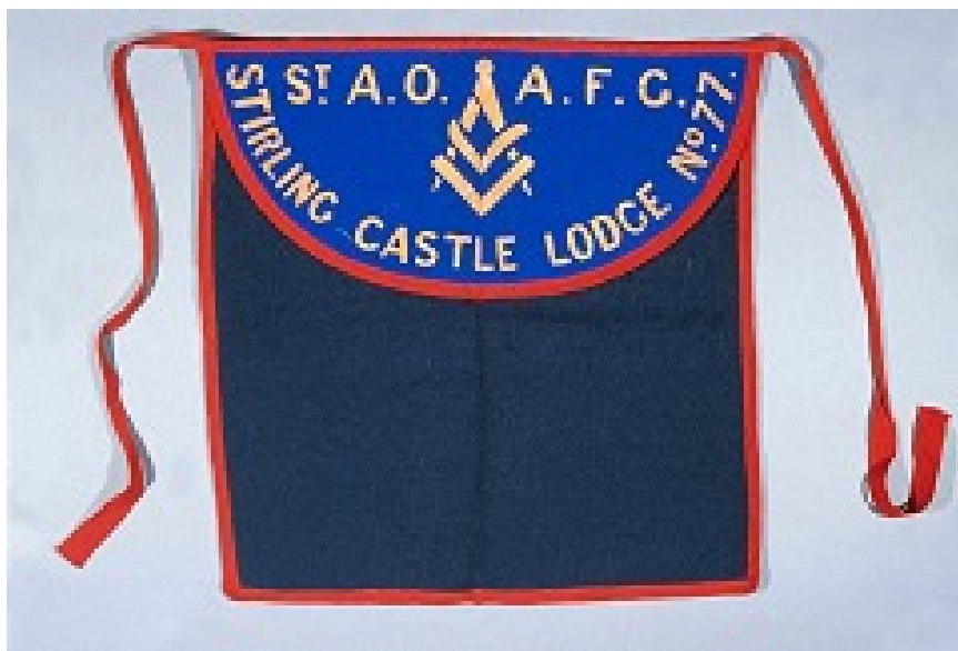
Figure 15 Showing a Example of an Apron