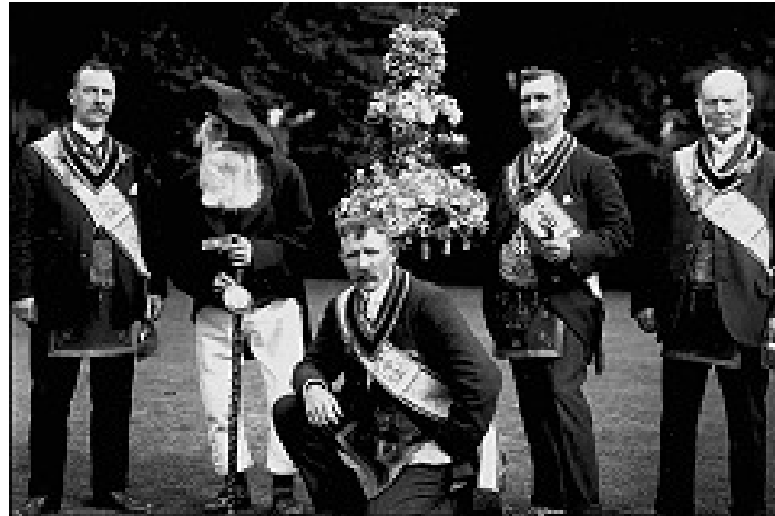
Figure 3 Showing “Old Adam” and Office Bearers of Penicuik Thistle Lodge