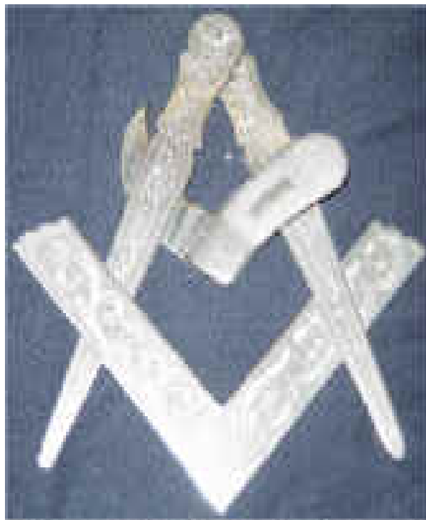
Figure 8 Showing the Principle Emblem of the Free Gardeners

The principal emblem has the square and compasses conjoined as in the Craft with a pruning knife open at an angle of sixty degrees to indicate the gardening connections.