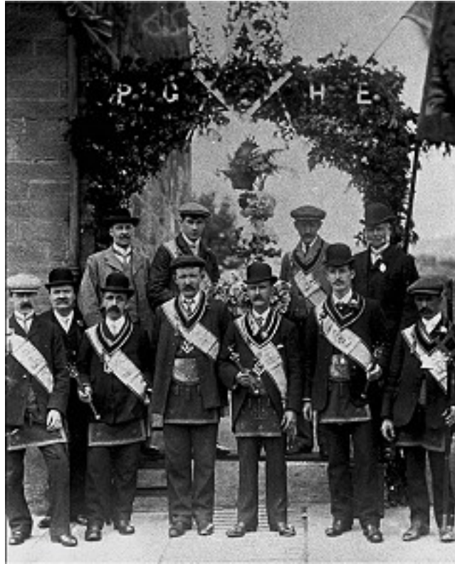
Figure 6 Picture showing Penicuik Thistle Lodge Office Bearers Posing in front of the Master's House

The Free Gardeners organisation appears to have been essentially democratic being run along similar lines to the Free Masons with the officials regularly elected and the box where their money and papers were kept being the subject of regular audit.