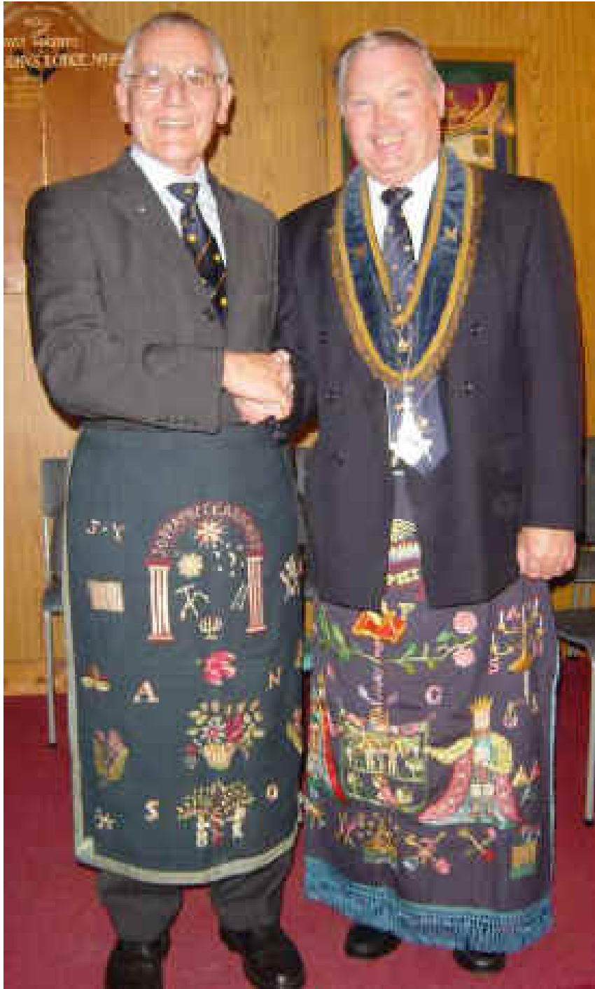
Figure 17 Showing Examples of Free Gardeners Aprons