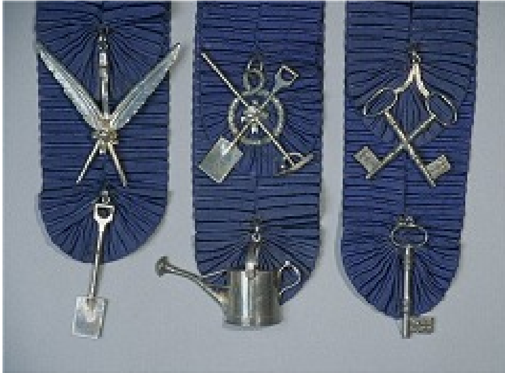
Figure 9 Showing the Insignia of Office of Some Collars

Working tools were also included such as crossed spade and rake, watering pans, reel and measuring line etc