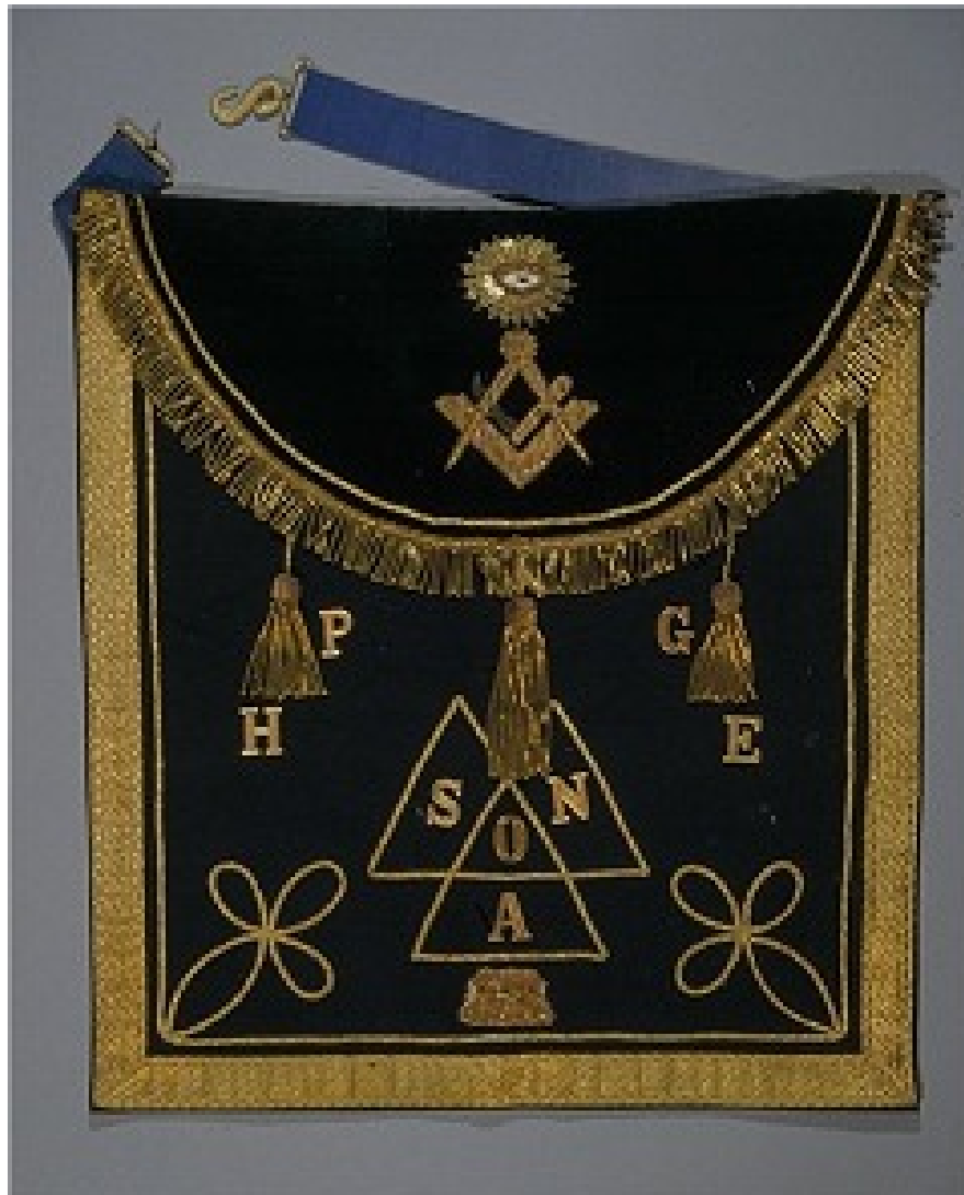
Figure 13 Showing a Example of an Apron

The letters A.N.S. and O are also present which refer to the three Grand Master Gardeners (Adam, Noah and Solomon) and the Olive sign and grip of a Master Gardener.