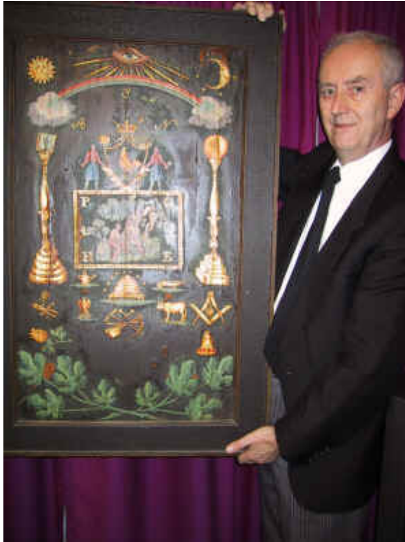
Figure 7 Showing a 1 st Degree Tracing Board