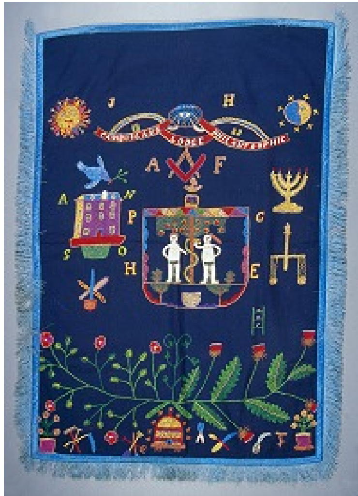
Figure 18 Showing Examples of Free Gardeners Aprons