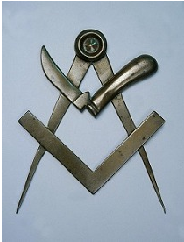
Figure 1 Showing a Typical Insignia of the Free Gardeners

Brethren, this talk was prompted by a visit to Melbourne when I saw an insignia showing a similar arrangement to our own square and compasses.