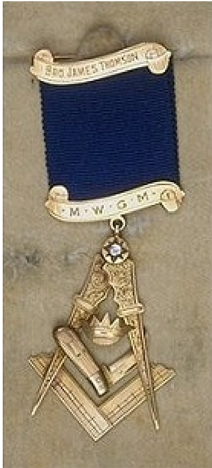
Figure 11 Showing a Master's Jewel