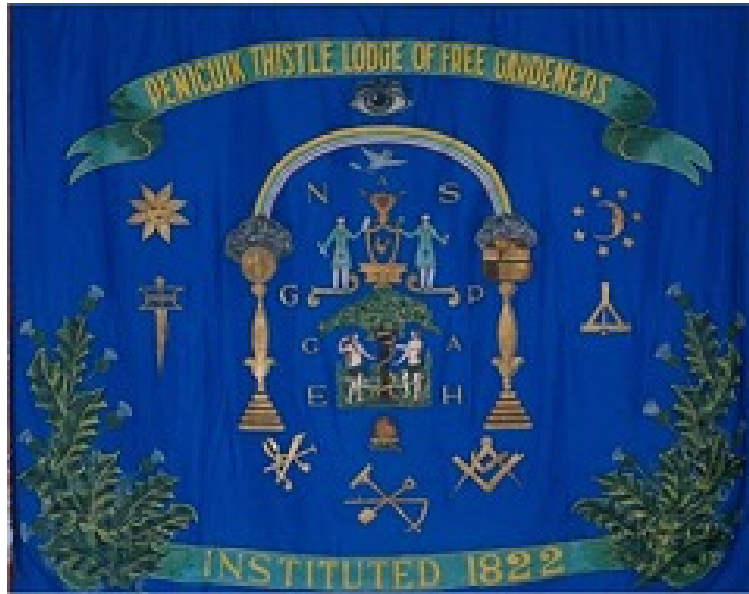
Figure 19 Showing a Banner of Penucuik Lodge