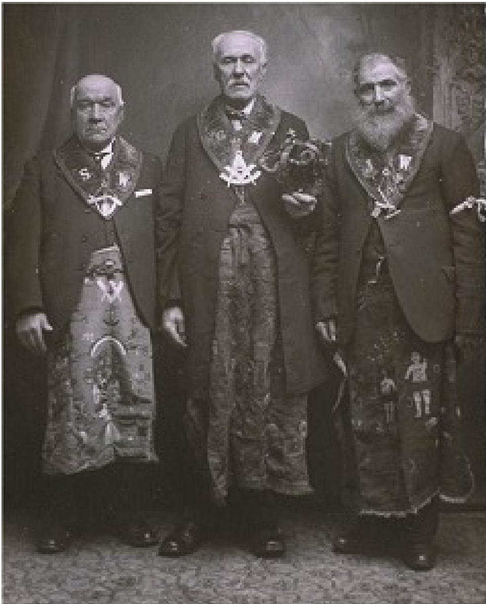
Figure 2 Showing Insignia of Lodge Officers

In Dunfermline the senior officer was called "Deacon", with the title later changed to 'Chancellor'. In Haddington, the titles 'President' or 'Chairman' were used. From other documents it would appear that the lodge officers consisted of the Master, two Wardens, Chaplain and Inside and Outside Tylers.