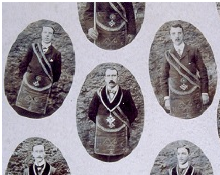
Figure 4 Showing Office Bearers of Black Agnes Lodge, Dunbar