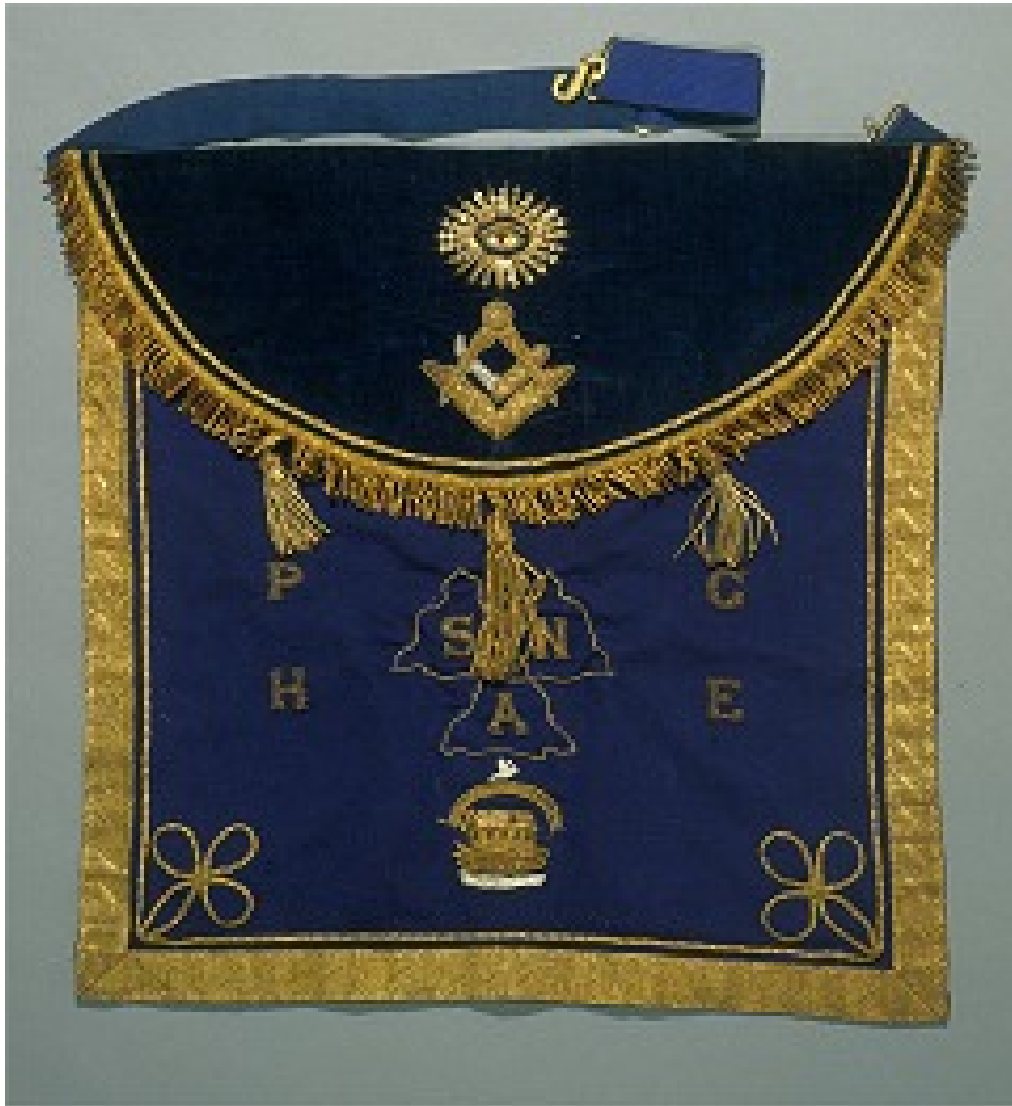
Figure 16 Showing a Example of an Apron