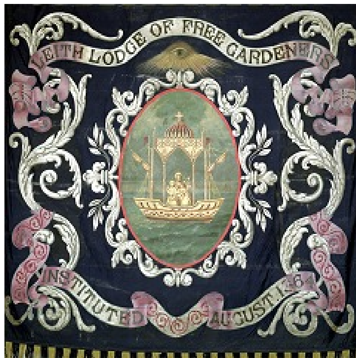
Figure 20 Showing a Banner from Leith Lodge