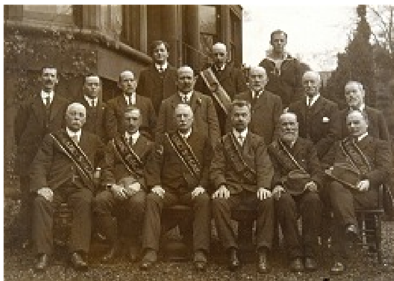
Figure 5 Showing the office bearers of a Lodge in Dunfermeline 1916