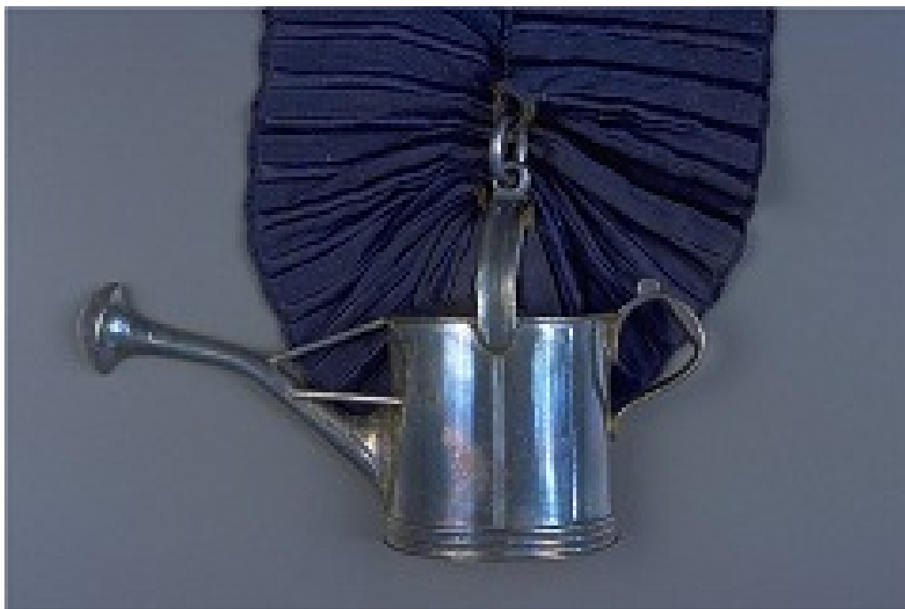
Figure 9 Showing a Detail of one of the Insignia of Office