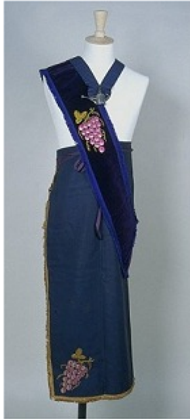
Figure 14 Showing a Example of an Apron